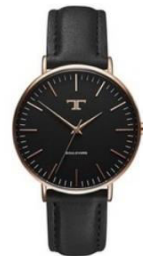
Rose gold black